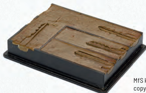
MfS key copying kit

Numerous, often unique objects such as specialized cameras, bugs, burglar's tools or devices for clandestine opening of letters bear witness to the extent of the surveillance of people by the Stasi.