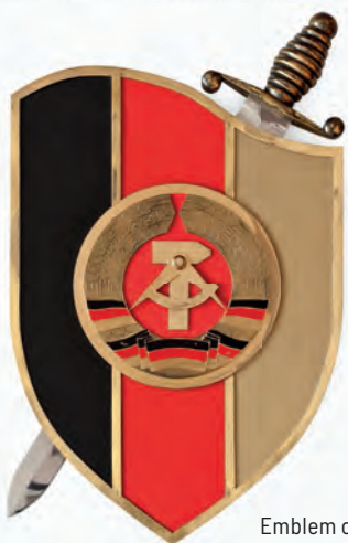
Emblem of the MfS

For over 40 years, the Socialist Unity Party of Germany (SED) succeeded in keeping millions of people in East Germany under control. An important instrument for this was the Ministry of State Security (MfS) as the „shield and sword of the party“. The Stasi, as the MfS was popularly called, had to secure the power of the SED and control large parts of society.