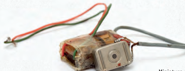
A bugging device built by the Stasi

The offices of Erich Mielke, the last Minister for State Security, have been preserved in their original condition to this day and can be visited as part of the exhibition.