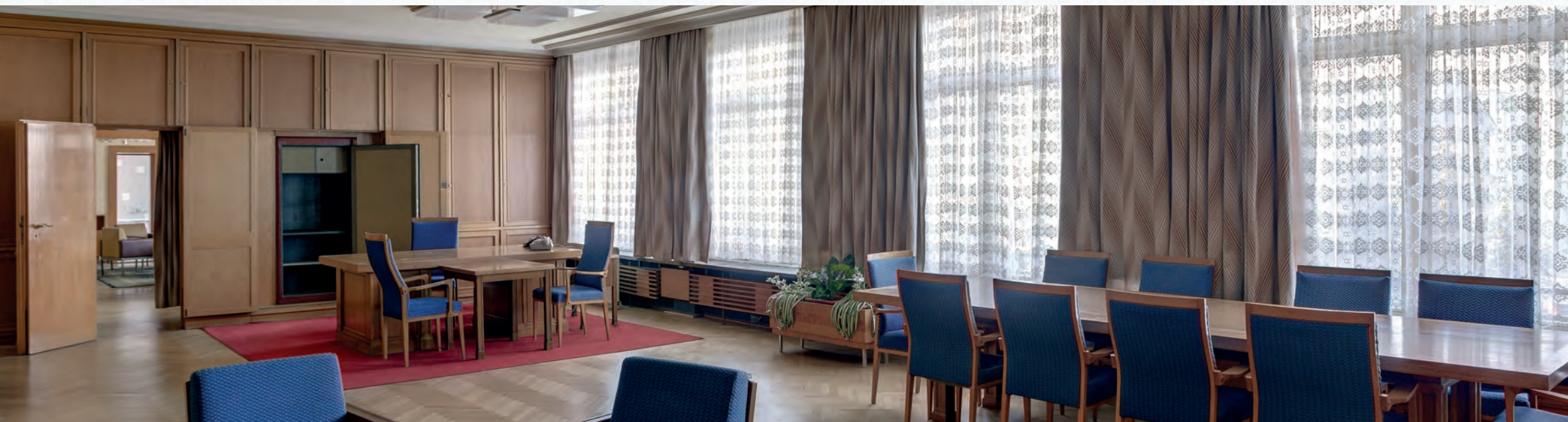
Erich Mielke's office