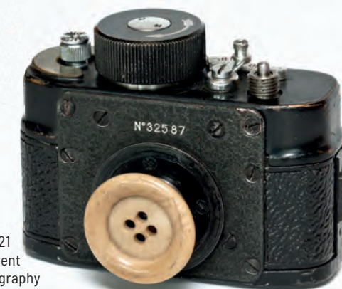
Miniature camera F-21 with button attachment for concealed photography

The exhibition was developed by the non-profit supporting association of the museum ASTAK e.V. together with the Federal Commissioner for the Stasi Files.